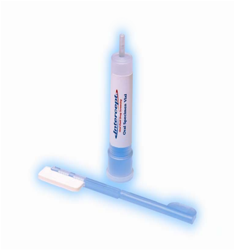
Drugs of Abuse Testing